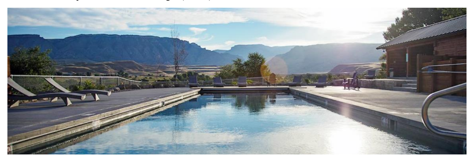
Days 3 to 5 (Tuesday to Thursday) Three full days to enjoy the ranch with morning, afternoon and full day rides on offer. Daily riding will be organised to suit – you can chat with head wrangler Tom, manageress Rebecca and Peter and Marijn your hosts each evening to decide how much riding you would like to do the next day and there are numerous routes for morning, afternoon and full day rides. Optional riding lessons may also be available and cattle work is often on offer, moving cattle between grazing or trying your hand at penning and sorting. You can also learn to fly-fish with the ranch's guide and if you do not wish to ride, might try your hand at archery targets or trap shooting or perhaps take the afternoon off to swim and relax or for a drive into Cody, some shopping and dinner before visiting the night Rodeo in summer (extra charge). Three nights at the Hideout (B,L,D)

Day 2 (Monday) After breakfast, meet in the Barn at about 8.30am for an introduction to the wranglers, horses and a short demonstration of riding techniques used on the ranch. Mount up and after ensuring you are well matched with your horse, tack and fellow riders, either head off on a first ride close to base or horses may be loaded into trucks and taken a little further afield to explore. Return to base for lunch at about 12.30pm and a rest before an afternoon ride or different optional activity, returning to the ranch in the late afternoon. Drinks in the main bar at about 6.30pm, then dinner and night (B,L,D)