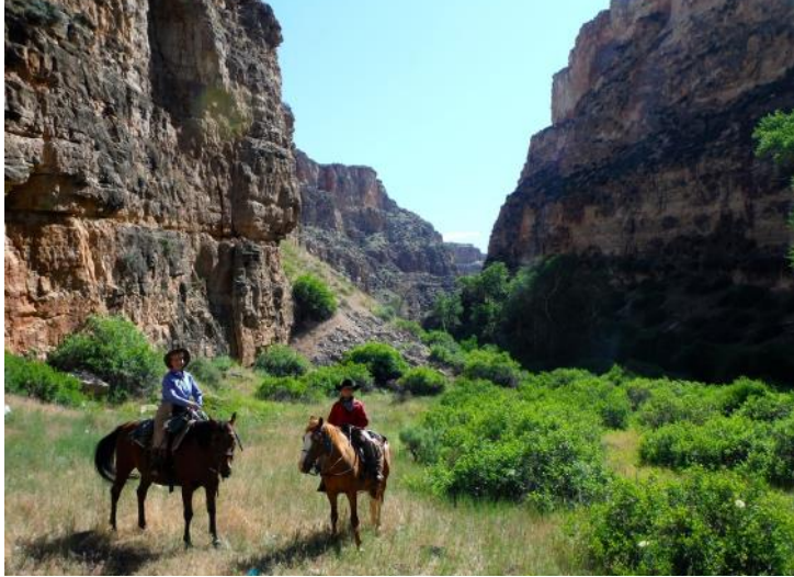
Day 6 (Friday) Breakfast and perhaps an all-day ride to the dramatic Copman's Peak with picnic lunch carried in saddle bags. Return to the ranch in the late afternoon for showers and time to relax before a friendly end of week BBQ with wranglers and guides. Final night at the ranch (B,L,D)

Day 7 (Saturday) Breakfast on your final day before departing (check-out 10.00). (B)