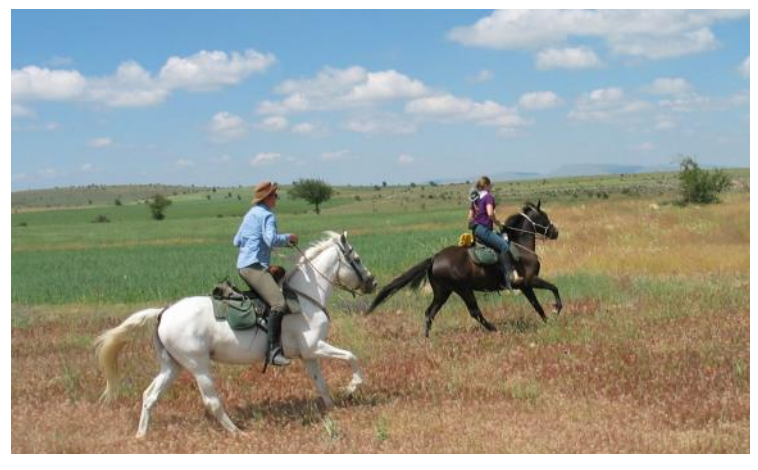
Day 4 - After saddling up set off again. A quick canter takes you to Golgoli, with time to visit the underground village and see the church hewn into the rock. From here the route takes you well off the beaten track through extraordinary rock formations, vineyards and orchards, surrounded by table-mountains. Reaching the old Greek village of Mustafapasa, you ride through the centre of town, admiring the beautiful Greek architecture, and perhaps stopping for a drink (or for lunch if the weather is not good). From Mustafapasa climb to the plateau again, where there are more chances to canter. A short ride brings you back to the hotel at Ayvali, where if the weather is sunny you have a late lunch by a swimming pool with the afternoon to relax. Dinner and second night in Ayvali. (B,L,D)