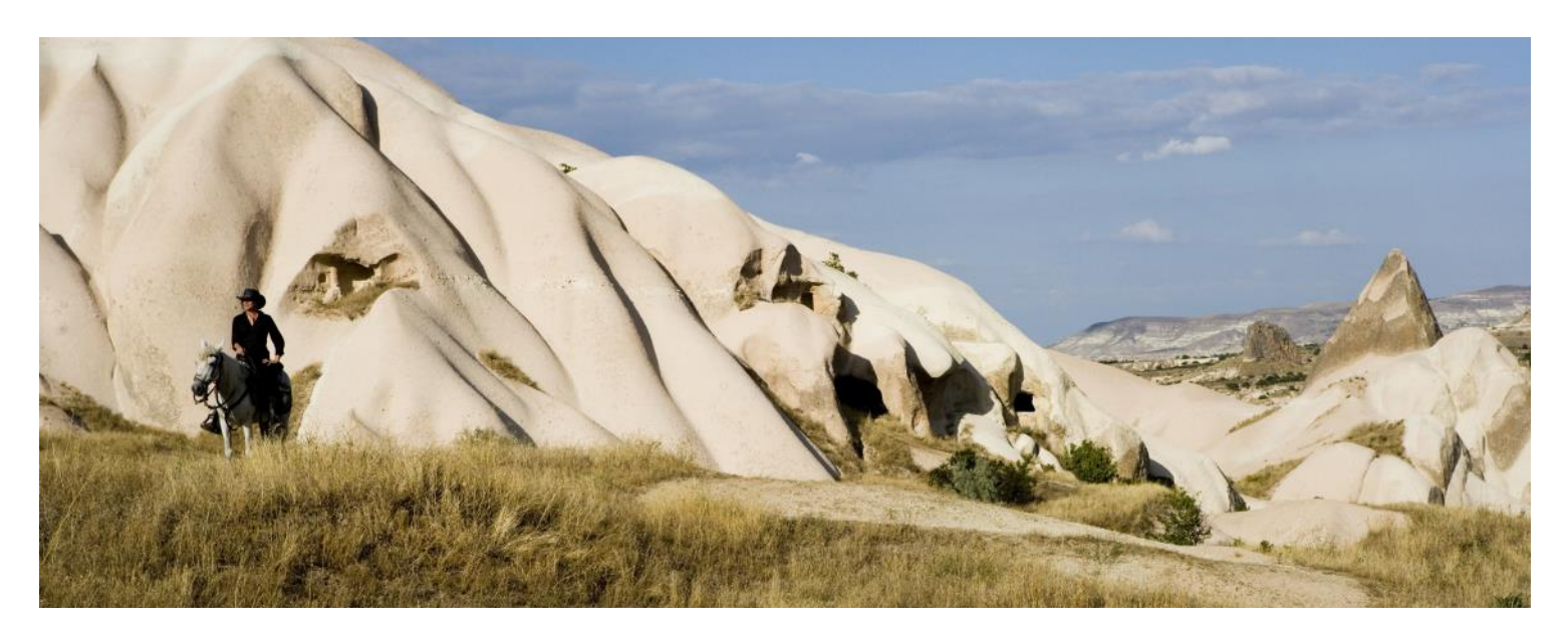
Day 7 - Riding from the guesthouse enter the beautiful White Valley, passing stone labyrinths, lush vegetation, and the impressive fairy chimneys of yet another Love Valley. Crossing the picturesque village of Çavuşin, dismount for a short walk to reach the plateau of Boz daha. A wonderful canter along the ridge, overlooking Red Valley on one side and Devrent Valley, with its strangely shaped fairy chimneys, on the other. Further canters take you through a maze of sandy paths and the woods of Urgup to reach the valley of Pancarlik and its multicoloured rock formations, gardens and orchards, before finally arriving back at the ranch by early afternoon. Farewell tea on the terrace, then you are driven back to the guesthouse in Ortahisar or Urgup. A visit to the local Hamam can be arranged (50€ per person, including wellbeing treatments for body relaxation, payable locally) (B,L,D).

Day 6 - This morning, the option of a hot air balloon ride over the fantastic landscapes of Cappadocia (extra cost payable locally, if you choose to take the hot air balloon ride you will need to wake up at around 03.30). Return to the guesthouse for breakfast, then set off riding again, picking your way through the rock tunnels, arches and small woods of the spectacular, 4 km-long canyon called the Green Valley. A detour through the famous Love Valley with its gigantic phallic rock formations, then onto Sword Valley and Red Valley. With its citadels of red, pink and ochre rock, and its beautiful troglodytic churches, this is Cappadocia's most spectacular ensemble of geological formations. Lunch at a cave café in an ancient monastery and in the afternoon, continue through Red and Rose Valleys, then ride out into the fields, surrounded by the rocky hills of north Cappadocia. The winding paths of the Shepherd's Valley take you back to Uchisar, in time for a drink on the terrace at sunset. Dinner and night Uchisar. (B,L,D)