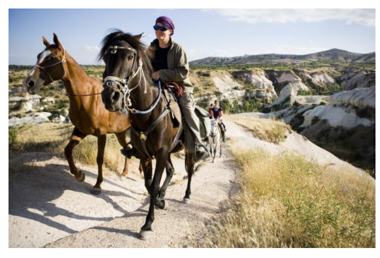
Day 3 - Breakfast and saddle up. The day starts with a canter through fields of barley, wheat, oat and beans on the high Anatolian plateau (1600 m), then dismount for a 20 minute walk, leading the horses down a steep narrow trail, to Damsa lake. A winding canter to an old monastery where again the local villagers will cook lunch for you. In the afternoon ride on, following a route that overlooks a valley of fairy chimneys and the bare hills surrounding the lake (in good weather perhaps a swim in the lake with your horse). Chances to trot and canter along tracks of soft red clay and through a hidden canyon to the village of Ayvali. Dinner and night a guesthouse in Ayvali. (B,L,D)