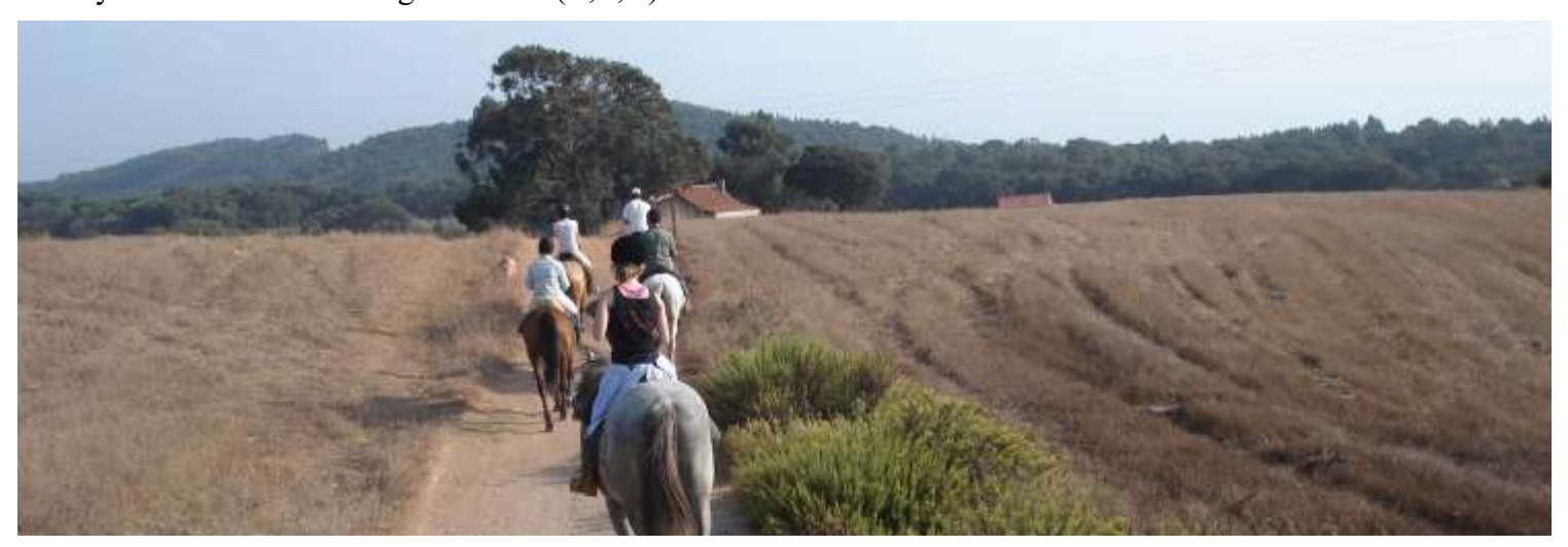
Day 3 (Wednesday) and Day 4 (Thursday) - Two half days riding out from the farm. You might explore the Gaio valley, follow paths along the cliff tops with wonderful views over the rocky coves and unspoilt beaches that line the coast, or head inland through the cork oak forests to the Serra do Cercal. There will be plenty of chances for long canters on wide, sandy tracks. Picnic lunches and dinner at the family restaurant are included. Nights at Herdade Pessegueiro. (B,L,D)

Day 2 (Tuesday) - After breakfast mount up and set off riding, heading north to the small fishing village of Porto Covo, following winding cliff tops with wonderful views over the rocky coves and unspoilt beaches that line the coast. Plenty of chances for long energetic canters on wide, sandy tracks before riding into a cork oak forest. Return to Herdade Pessegueiro for a picnic lunch and an afternoon at leisure (approx 3 hours riding). Dinner at the family restaurant and overnight at base. (B,L,D)