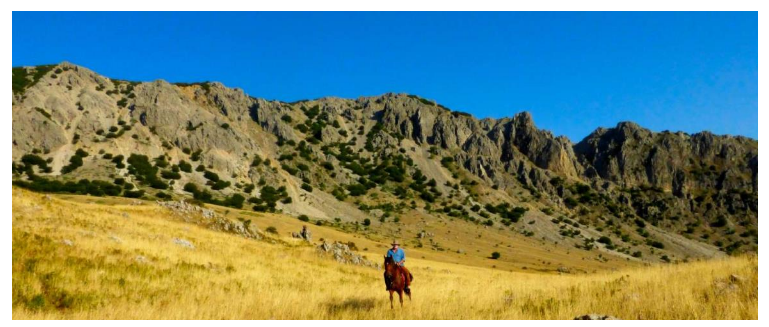
Day 8 - Breakfast and group minibus transfer (about 1 ½ hours) to Catania airport (in time for earliest flight in the group - to be confirmed when there; if you prefer a private transfer can be arranged at an extra cost).

Day 7 - Breakfast and the final riding day follows the winding dirt road that circumnavigates Etna. As you ride you will see how the lava flows are becoming colonised by different plants, many of them endemic, all struggling to gain a foothold. After Mt Spagnolo crater (covered by forest) the route is cut by a more recent lava flow, formed during a 3 month eruption in 1981 that almost collided with the town of Randazzo, only diverting to one side at the last minute. Stop for a rest and picnic (again a sandwich in saddle bags as vehicles are not allowed on the mountain) before setting off again. The exact route will depend on visibility and conditions but if the weather is favourable, you might climb high up onto the dust-covered volcanic slopes, riding along the narrow ridges of black ash and perhaps going as high as the Observatory before heading back down in the late afternoon to meet up with the horse lorry. Goodbye to the horses who will head home and a short drive to a small mountain chalet-style guesthouse, Rifugio Ragabo where the last night is spent. A celebratory drink with your guides before they leave to take the horses home. Final dinner and night at Rifugio Ragabo (about 5 hours riding, 0km on tar road). (B,L,D)