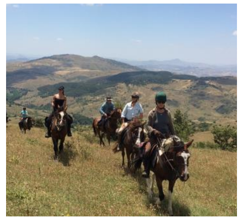
Day 6 - Breakfast before a drive of about ½ an hour to meet the horses. Mount up to set off on a slightly shorter riding day, heading down to the valley between Nebrodi and Etna, through the Gurrida Lake Reserve. Lake Gurrida is a seasonal swamp, created as flow of the Flascio river water is blocked by ancient lava fields and features of the Reserve, for which special permits are required, include banks of pumice and lava fields full of volcanic bubbles. After the Reserve, the route follows an ancient track across the "Circum Etnea railway" before a long climb through the mixed forests that cover the northern lowest part of the volcano. After meeting the back up for a picnic lunch, leave the horses in a paddock and transfer back to hotel Fucina del Vulcano for dinner and second night (about 4 hours riding, ½ km on tar road). (B,L,D)