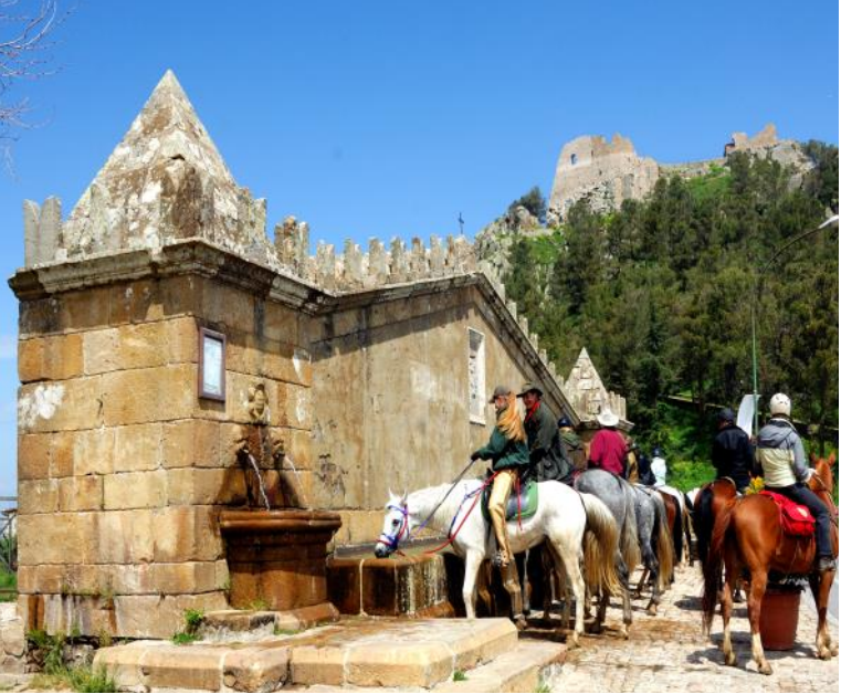
Day 3 - Breakfast and set off riding, first following a dry river bed (flowing water only in winter), where there should be chances to canter. Then a short way along a tarmac road that crosses a wind turbine park where the horses can stop to drink. After this, perhaps a long canter along the mountain track before reaching the Sambuchetti - Campanito Natural Reserve and riding through forest in the shade of oak trees. Meet the back up for a picnic lunch on the far side of the Reserve, then in the afternoon continue on the remains of an ancient trail across typical Sicilian countryside to reach Agriturismo Monte Soprano, where the night is spent (pool open in summer). Dinner and night Monte Soprano (about 6 hours riding, approx. 2km on tar road). (B,L,D)

Day 4 - Breakfast and ride to Capizzi, an ancient village at the gates of Nebrodi Park. There may be time for a short break in the town before continuing the climb along the "Dorsale dei Nebrodi" a path that winds through beech forests and is the basis of the route for the next two days. After reaching the ridge, the path follows the water divide through thick shaded woodland. Stop for a sandwich picnic lunch (the vehicle cannot reach you today) and in the afternoon ride on to the pass of Femmina Morta (the 'dead lady') and to hotel Villa Miraglia in the Nebrodi National Park. A delicious dinner and the night at Villa Miraglia (about 5-6 hours riding, approx. 2 km on tar road). (B,L,D)