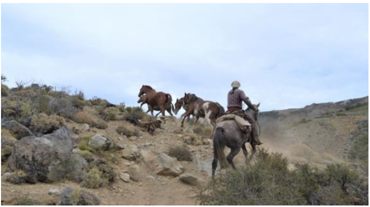
Day 5 - Breakfast in camp before mounting up to head off again, following the Chubut River valley. There are now more signs of human habitation including deserted corrals, derelict farms and an abandoned gold mine. Further on you might visit the remote homestead of the Miranda family, sheep and cattle farmers who still live a pioneering existence. In the late afternoon finally arrive at El Sapucai, a small farmstead belonging to your hosts on the shores of the Chubut River. A delicious dinner, perhaps venison or beef from the farm and the night at El Sapucai. (NB No electricity but a shower with hot water!) (5 - 6 hours riding). (B,L,D)