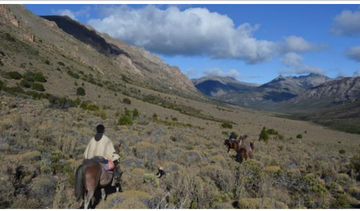
Day 6 - Breakfast in the cozy farmhouse and set off riding again in the Alto Chubut area, climbing high into the hills with beautiful views of the surrounding mountains. The ride takes you through meadows and forests and across some rocky terrain where you will appreciate the footwork of your nimble criollo horse. After a long climb, reach the lunch spot which, weather permitting, may be on the shores of a small lake encircled by peaks. After a leisurely picnic ride back to El Sapucai by a different route through southern beech forest and along narrow trails. Dinner & night at El Sapucai (6 - 8 hours riding). (B,L,D)