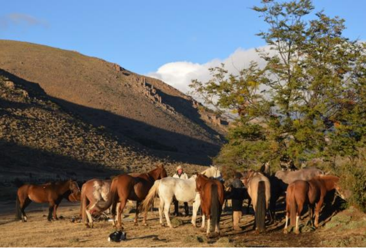
Day 7 - The last day riding. Set off following an old track to Escuale Vieja. The views today are typical of Patagonia and help you appreciate the immensity of the area. A picnic lunch by the river and continue to the road head. Here you say farewell to the horses and baqueanos and transfer by private minibus, about 2 hours to Bariloche. Hot showers and a welcome dinner at a local restaurant, before the night at the hotel or guesthouse in Bariloche. (about 5 hours riding). (B, L, D)