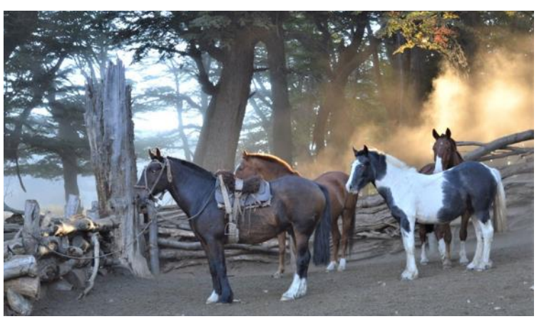
Day 3 - After breakfast around the campfire mount up to set off riding, first through gentle hills and large valleys, then climbing a path that is mainly used by local countrymen to move cattle. Arrive at the pass "Paso sin Nombre", about 1,700 meters above sea level where there are some beautiful rock formations and views open onto a large valley enclosed by mountains, the "Alto Chubut". Continue riding until you get to an idyllic spot surrounded by native southern beech forest (lenga). The night is spent at a simple mountain refuge close to an isolated shepherds hut. Dinner and night at the refuge. (6 - 8 hours riding). (B, L,D)

Day 4 - Leave behind the forests and clear streams to descend to the Patagonian Steppe. This area is semi-desert, with native tussock grass "Coiron", berberis bushes "calafate" and some small stunted beech trees (northofagus Antarctica). First passing some solitary lagoons, you rejoin the Chubut River which yesterday was still just a trickle but has now grown to become a respectable mountain stream. The landscape is wild, impressive, with almost no human presence. Camp is set up in this wonderful environment on the shores of the Chubut. Dinner and night in camp (5 - 6 hours riding). (B,L,D)