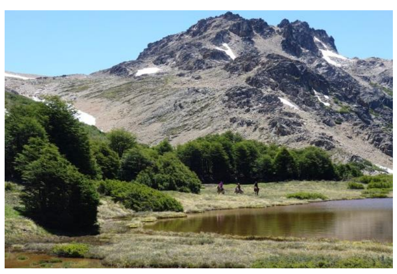
Day 2 - Breakfast in the cozy kitchen whilst horses are brought to the corral. Your guide and the banqueanos help you saddle up and, once settled, set off riding to a lovely viewpoint in the foothills where there will be a stop for a picnic lunch and perhaps a siesta, taking time to enjoy the immensity of the steppe and to slowly adjust to this new environment. Depending on the mood of the group, you might stay a while or may choose to ride on exploring a little further afield, before returning to El Sapucai by a different route. Time to relax in a hammock and read or to explore on foot for the rest of the afternoon. Then hot showers, drinks and a delicious dinner of local produce cooked over the fire or on a woodboring stove. Night El Sapucai. (2 - 4 hours riding) (B,L,D)

Day 3 - A good breakfast to set you up for a more demanding day. Then mount up and head off upstream, riding into the Alto Chubut valley. After about 2 ½ hours, reach an old gold, silver and lead mine where you stop for lunch, perhaps meeting members of the Miranda family, long time inhabitants of the valley and always full of interesting stories and entertaining anecdotes. Or you may take a different route, riding to a remote lake high in the hills before returning to El Sapucai for dinner and the night. (5 - 6 hours riding) (B,L,D)