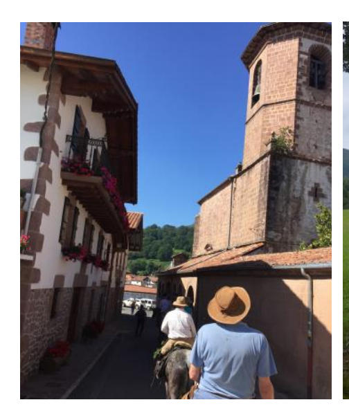
Day 7 - After breakfast collected & transferred to Biarritz (or Bayonne) in time for onward flights / journey (B)

Day 6 - Ride from the stables up into the open country around La Rhune mountain which saw a number of battles in the concluding months of the campaign as Wellington's army pushed into France and onto victory. Wonderful panoramic views out to the sea and the seaside town of St Jean de Luz as well as the country that you have covered over the last 5 days. Picnic lunch in a shady spot before riding back along the Nivelle river and to Sare where the ride ends. Overnight Olhabidea Chambre D'Hotes (or similar), a Basque country guesthouse where there will be a final celebratory dinner. (B,L,D)