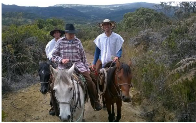
Pace & Terrain The riding pace is expected to vary from day to day according to the terrain and altitude and will also depend on the ability of the group, but overall expect a slow to moderate pace due to the terrain. There will be some chances for long canters on sandy tracks, but also some steep climbs, riding on narrow tracks through thick forest and cobbled streets into and out of villages. In some places you may need to get off to lead your horse over steep, rough or rocky ground. The route goes through a variety of landscapes, from the verdant coffee plantations and surrounding jungle to the higher altitude mountains and dusty desert plains.

Riding Experience To participate in the ride you must be a reasonably competent rider who is used to riding in open country and over varied terrain. As a minimum to join the ride, you should be comfortable, well balanced and secure in the saddle at a walk, trot and canter and able to control a well-schooled horse at all paces. Hours on some days will be quite long and you are bound to enjoy the ride much more if you are reasonably riding fit. If you are not used to riding for several hours a day, we recommend concentrated practice before you go to get used to the hours in the saddle.